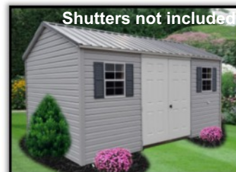
Garden Shed Buildings up to 14' long - 1 window 16' and longer - 2 windows Shown in vinyl* 10% upcharge