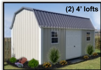
Metal Lofted Garden Shed Buildings up to 14' long - 1 window 16' and longer - 2 windows