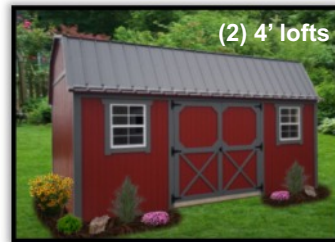
Lofted Garden Shed Buildings up to 14' long - 1 window 16' and longer - 2 windows