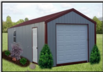
Metal Portable Garage 9x7 garage door, 3' entry door and (1) 30x36" window