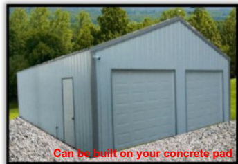
Metal Built on Site Garage (2) 9x7 garage doors, 3' entry door and (1) 30x36" window