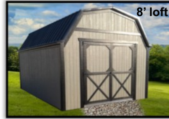
End Loft Your choice double door or 5' roll up door 8' wide - 4' roll up door