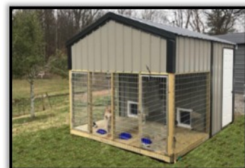
Dog Kennel Entry door, 2 kennel doors, 2 insulated dog boxes and (1) window