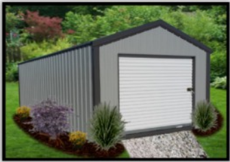
Standard Metal 8' Wide - 5' roll up 10' - 14' Wide - 6' roll up

All buildings in this column available in your choice of painted or urethane siding and metal or shingle roof, except Pool House.