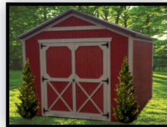
Utility Your choice double door or 6' roll up door 8' wide - 5' roll up door