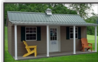
Vinyl Pool House 12' wide - 3'6" porch / 14' wide - 4' porch 9-lite door, (4) 30"x36" windows, shutters and cupola