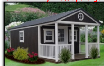
A-Frame Cabin Your choice 4', 6' or 8' porch (loft above) 9-lite door, (4) 24"x27" and (1) octagon window