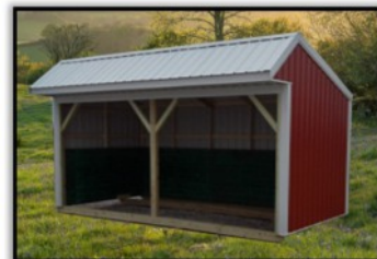
Open Horse Shelter 2' front overhang and 4' kick board