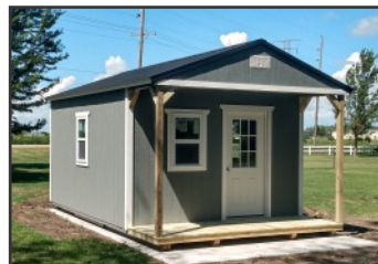
We can quote finished interior