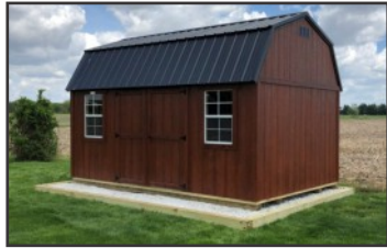
Includes two lofts and two windows