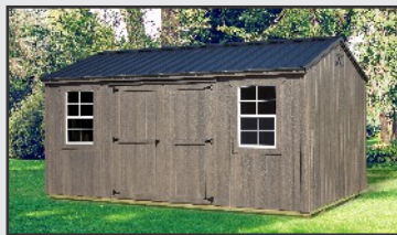
Includes two windows