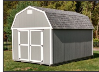
Includes two lofts