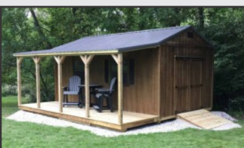
We can quote finished interior